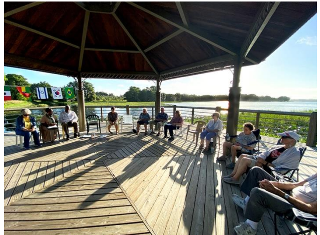
Photo is of the group